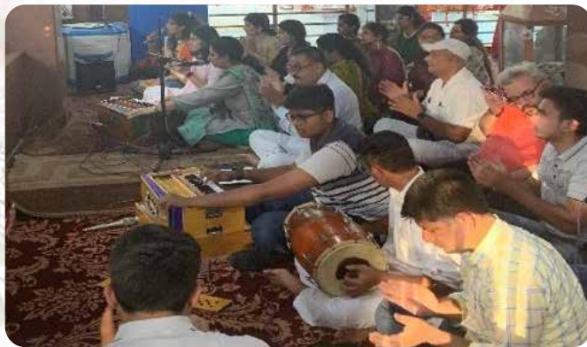
Bhajan at Kheer Bhavani temple