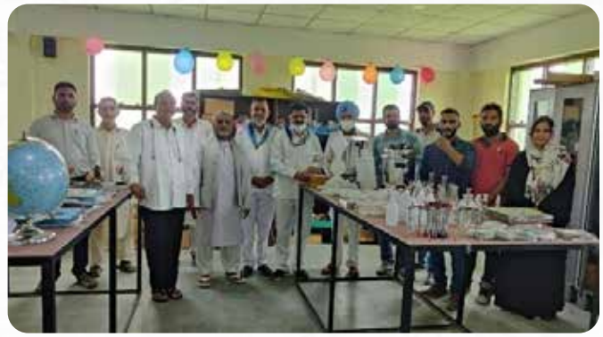
The Physics and Chemistry Lab after Inauguration at Spring Buds High School, Ompora