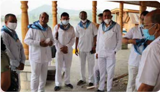
Team India enroute to the Medical camp