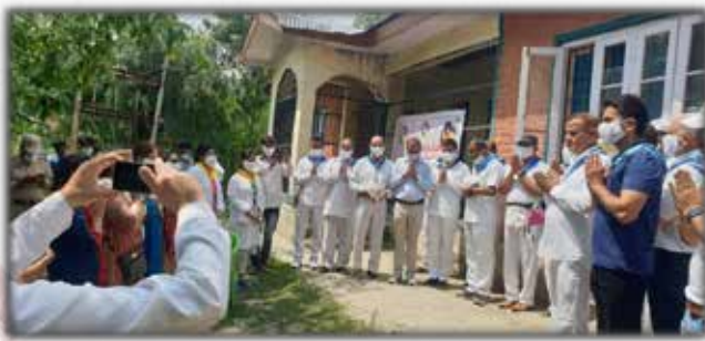
The Team Offering Prayers to Bhagavan – Camp Started with Omkaram

With Swami's blessings, the Day 1 began with a 2-and-a-half-hour drive to a remote village Talapora, Tehsil Khan-Sahib, Dist. Badgam. The team was given a rousing welcome by the villagers who were eagerly waiting to receive Bhagavan's Love through the medical camp.