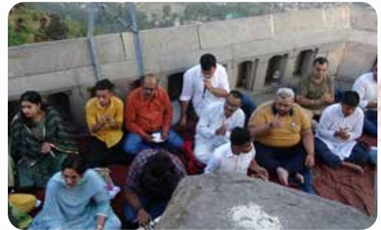
Children with the toys gifted to them with Love

Children were lovingly gifted small toys, sports utilities and playing kits according to their respective age groups. These toys were chosen with love and brought from Delhi and Punjab.