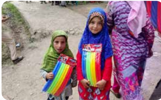
Children with the toys gifted to them with Love

It was gladdening to interact with children who had no direct knowledge of the world beyond their remote village. The dentist accompanying the contingent had a separate session with children on how to take care of their teeth.