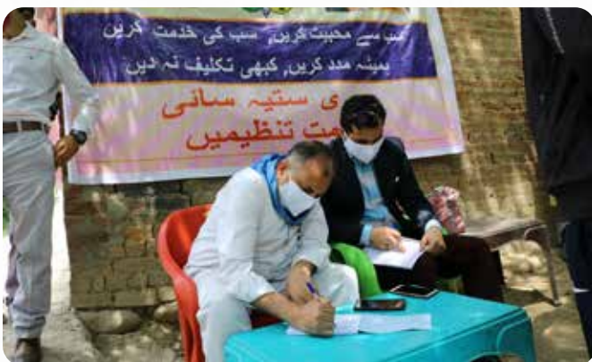
Registration with Local Interpreter