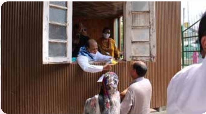
Pharmacy Counter @ Dal Lake Medical Camp

Two village residents offered their houses to set up a pharmacy counter and a place for eye check-up. Free medicines were given to all patients, who came to the camp.