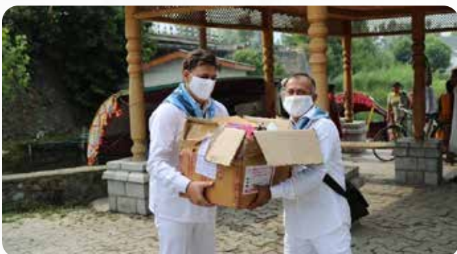
The Team enroute the day 2 medical camp in Shikaras

Thus, the first day of the medical camp culminated with His Divine Grace.