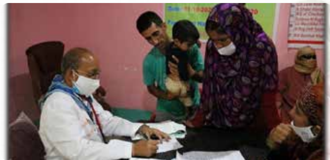
Dr.Vipin Singhal, Pediatrician examining the children of the village with love

Meanwhile, the view of the beautiful valley with apple laden orchards and walnut trees re-energized the team and reminded them of the nature's plenitude and selfless Love.