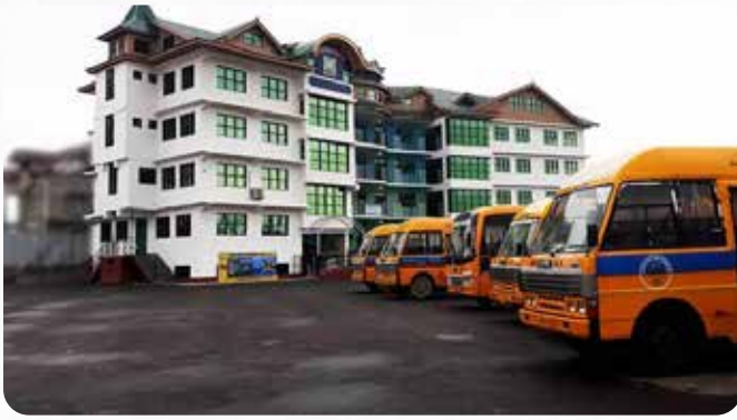
Spring Buds High School, Ompora