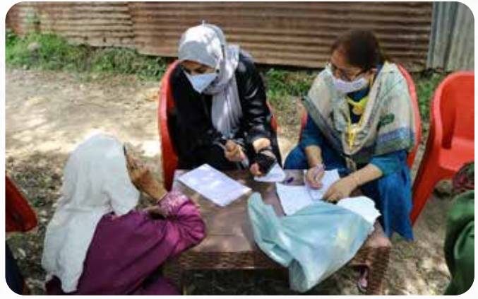
Pharmacy Counter and Registration Counter with Interpreter

Notably, young women were given a thorough medical orientation on menstrual hygiene. The lack of basic facilities and resources to make informed choices reflect the remote region's needful scenario. About 4,000 sanitary napkins arranged by the SSSSO India, were also distributed to all young women, therefore taking the first step towards a better menstrual health of these women. Oral Hygiene kits were distributed to the children to encourage them towards more awareness and better practices for oral health. Face masks and face shields were also distributed to the patients who did not have them.