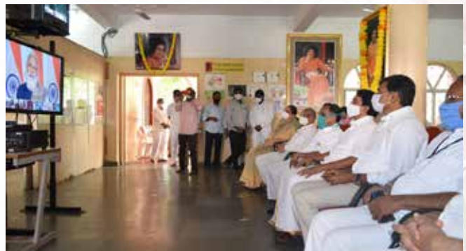
Listening to the PM's message